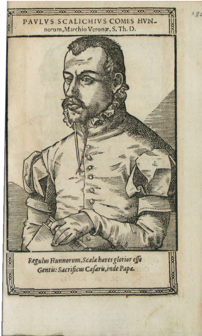
Fig. 1. Portrait of Paulus Scalichius. From Nikolaus Reusner, Icones sive imagines virorum literis illustrium (Argentorati: Bernardus Iobinus, 1587), f. 182r.